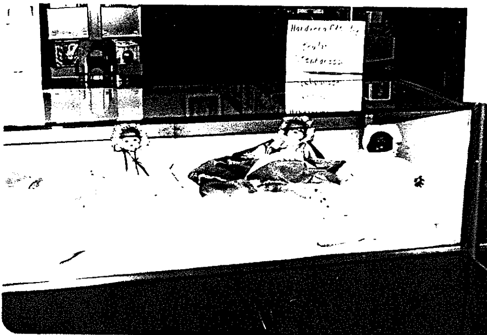
HAND-CRAFTED DOLL DISPLAY