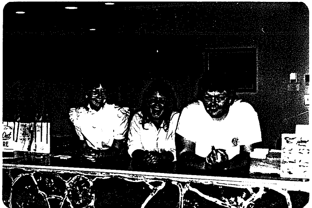
SUMMER GRANT EMPLOYEES