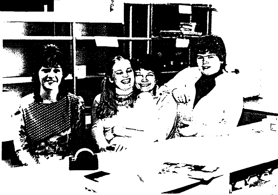
Happy Library Staff!